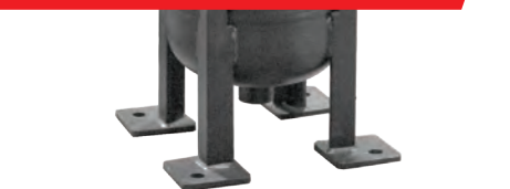
All pictures shown are for illustrative purposes only. Actual product may vary due to product enhancement.

8" Fabricated Basket Strainer, ANSI 600, with Optional Davit Assembly shown