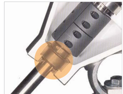
b Auxiliary bearing limits overhung loads on drive.

CONTAMINATION The nose cone configuration separates the gearbox from the output shaft. All gearboxes are grease lubricated (not oil). This reduces the potential for lubrication to follow the shaft into your application. Dynamix has added additional protection with a Double Lip Seal at the output end of the mount.