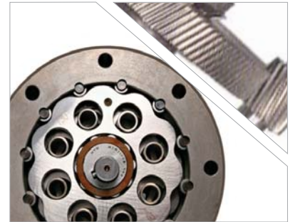
a Rolling compression removes shear and slipping problems related to traditional tooth gears.

HIGH SHOCK LOAD RATING When buying a mixer you are investing in torque and the construction to handle this torque. Our DMX 5000 Series offers one of the widest ranges of gear reduction; (5:1 – 21:1) or (350 - 83rpm). For heavy duty applications, where processes just cant fail we offer our DMX 5700 Series. These mixers can handle shock loads that are greater than 500% of their rating. This is the reason industry selects Dynamix when process downtime is not an option.