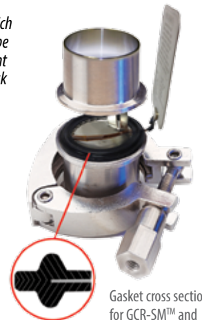
Gasket cross section for GCR-SM™ and GCR-SMS™

Viton is a trademark of DuPont Dow Elastomers LLC. Tri-Clamp is a registered trademark of Tri Clover Inc. NA Connect is a registered trademark of NovAseptic Equipment AB