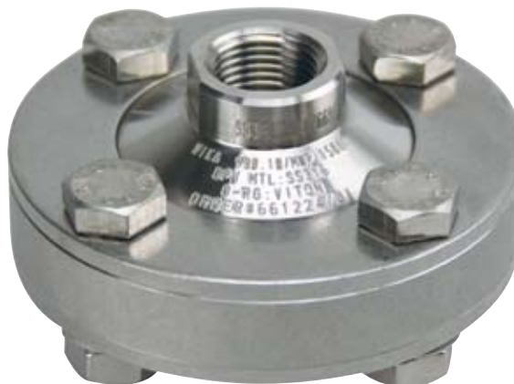
Standard Welded Diaphragm Seal Model L990.10

The diaphragm is welded to the upper housing which allows the replacement of the lower housing without jeopardizing the integrity of the system fill fluid and installed instrument. The upper and lower housing are bolted together and sealed by use of an O-ring. Process wetted components can be manufactured with solid metallic and nonmetallic materials.